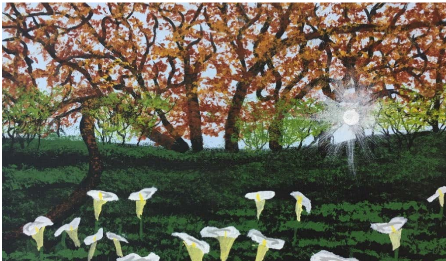
Artwork by: Katie Patterson

Or by mail or phone at: U.S. Department of Health and Human Services 200 Independence Avenue, SW Room 509F, HHH Building Washington, DC 20201 Toll Free: 1.800.368.1019